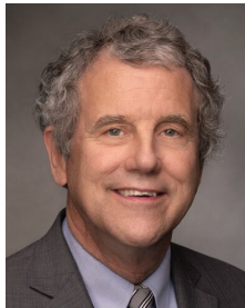
Sherrod Brown (D)