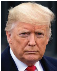
Donald Trump (R)