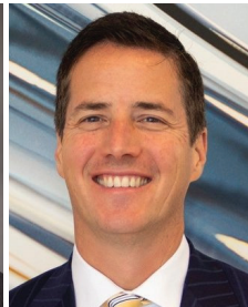
Bernie Moreno (R)