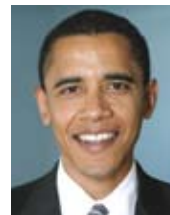
Barack Obama (D)