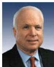
John McCain (R)