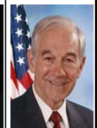
RON PAUL (R)