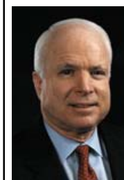
JOHN MCCAIN (R)