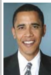
BARACK OBAMA (D)