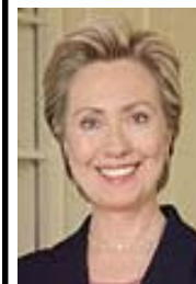
HILLARY CLINTON (D)